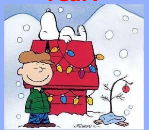
Oh, no! Not another tie or photo album!!

Want to give a gift that keeps on giving? Want to do something really nice for those at work, in your favorite organization or club, or for your ever-growing, extended family (of 10 or more)?